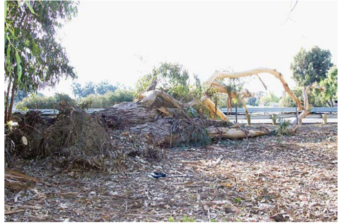
Fig. 4. Decay was associated with 62% of root failures in blue gum. Other contributing factors included dense crown and kinked and girdling roots.