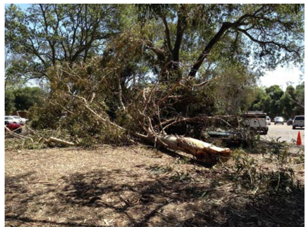
Fig. 3. Trunk failures occurred less frequently than branch or root failures. Codominant stems is the most commonly reported defect.

Trunk failures occurred in 14% of reported failures. Most occurred at the ground level (51%), while 49% occurred at a distance above the soil surface. Trunk diameter at the point of failure ranged from 7 to 99 inches, but the majority (61%) were between 7 and 24 inches in diameter. The primary defect associated with trunk failure is multiple trunks or codominant stems, observed in 33% of the cases. Dead portions of the tree and embedded bark were also associated with trunk failure, seen in 13% and 10% of cases, respectively.