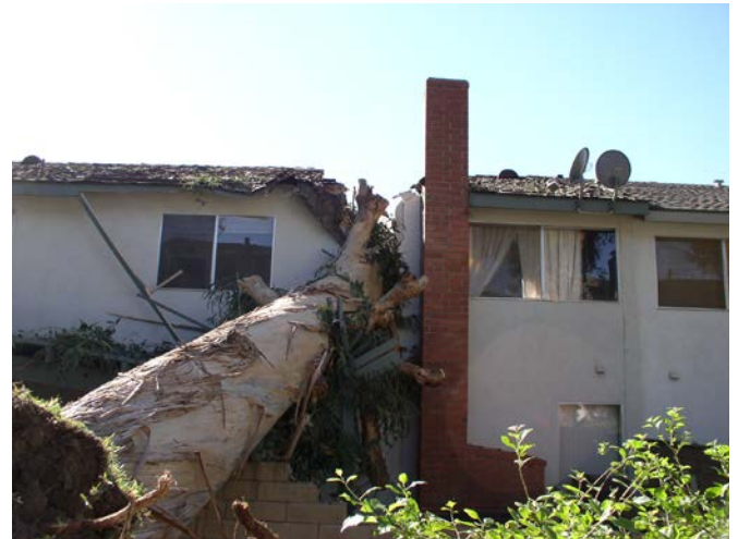
Fig. 1. Significant damage occurred to this house when a large blue gum failed.

By collecting detailed information following the failure of a tree, data can be compiled and then used to develop structural failure profiles for a species. Such a profile has been developed here for Tasmanian blue gum ( Eucalyptus globulus ) using data from the California Tree Failure Report Program (CTFRP). Arborists and foresters can use this information to develop structural management strategies for blue gum. The development of this profile was commissioned by the Britton Fund of the Western Chapter of the International Society of Arboriculture.